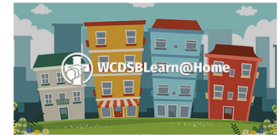
WCDSB Learn @ Home

Student Helpdesk: 519-578-3677 ext. 2316 (Leave a Message)